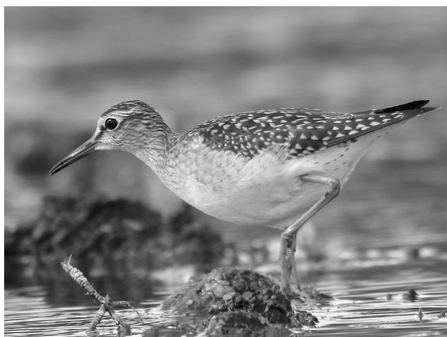
Wood Sandpiper, Burwell Fen