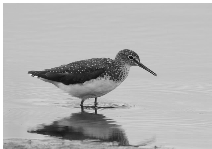
Green Sandpiper, Wicken Fen